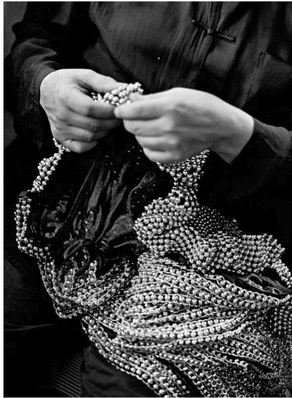
Azzedine Alaïa, Paris, 1989. Featured in Azzedine Alaïa. Peter Lindbergh (2021), published by Taschen.