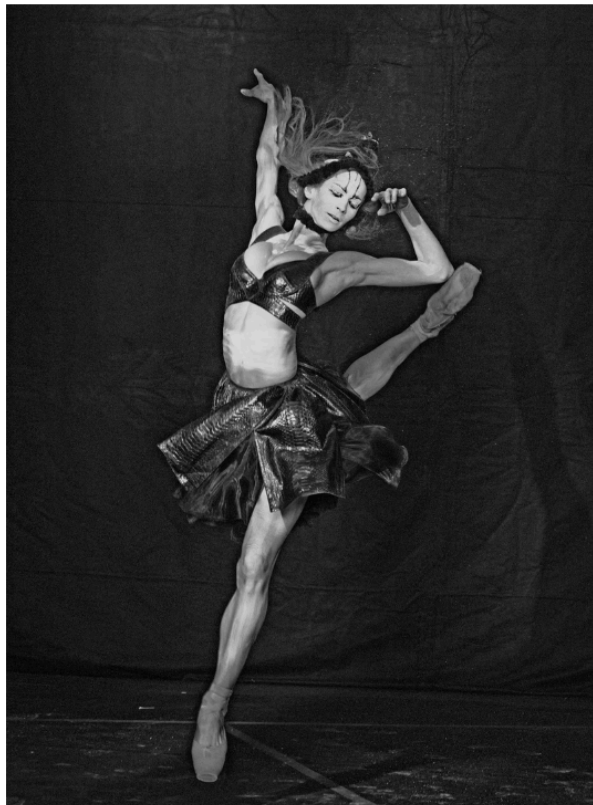
Polina Semionova, Berlin, 2010. Featured in Azzedine Alaïa. Peter Lindbergh (2021), published by Taschen.