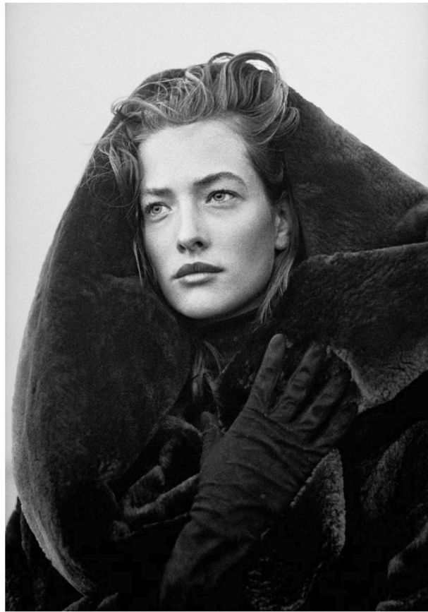
Tatjana Patitz, Le Touquet, 1986. Featured in Azzedine Alaïa. Peter Lindbergh (2021), published by Taschen.