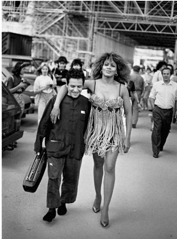
Azzedine Alaïa & Tina Turner, Paris, 1989. Featured in Azzedine Alaïa . Peter Lindbergh (2021), published by Taschen.